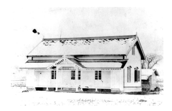
Fig. 2 Chokusôtei in Sapporo (1873)

One obvious objection to the integrated model suggested above is that architectural history, which is often marginalized in professional departments, will be co-opted by other fields, causing the loss of autonomy for the historians. In fact, though, all courses-in the mythical ideal department, at least—should be developed to guarantee scholarly freedom for the instructor on one hand and curricular effectiveness on the other. By relating history more closely to broader pedagogical goals, the new survey may in fact offer the possibility of bringing into the classroom more specialized history topics—perhaps drawn from the historian's particular interests. The sites for teaching architectural history may expand to the practice and design classes.